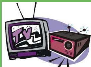
Broadcasts on Radio and TV