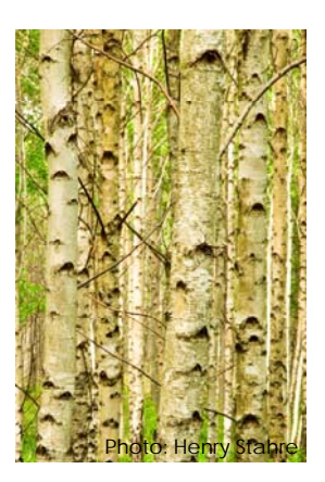
The balance of biodiversity and wood production is one important issue for the project.